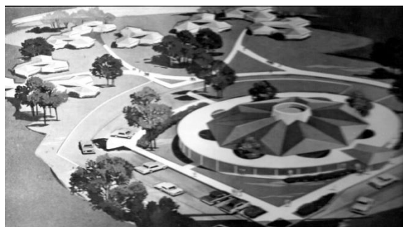
"The Quads" – 3-unit clusters of dormitory housing, upper left and top, flank the science center in the foreground at the north/west end of campus.