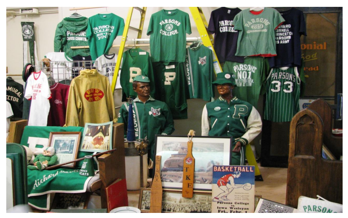
The CARNEGIE MUSEUM will throw open its' doors to all Students, Alumni and Friends Saturday, October 5<sup>th</sup>, at 1:30 p.m.. Photo above shows a sampling of the great Parsons Collection of old memorabilia.