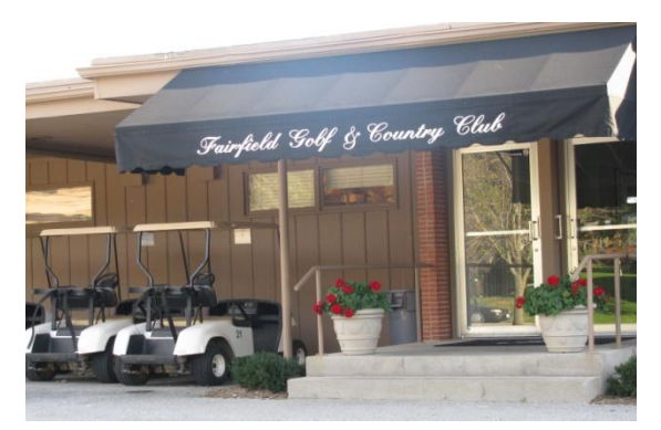
FAIRFIELD COUNTRY CLUB... The OLDEST GOLF CLUB west of the Mississippi and site of the Parsons All-Class Reunion's Friday, October 4th Registration and HAPPY HOUR!!