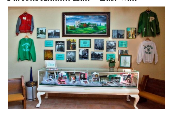
Parsons Alumni Hall - South Window