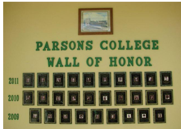
The plaques of the Parsons College Wall of Honor's 29 inductees hang on the west wall of the Parsons Alumni Hall located adjacent the Stephen Sondheim Center for the Performing Arts in the Fairfield Arts & Convention Center.