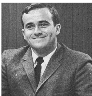
Steve Case 1966