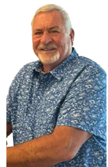
Joe in 2022